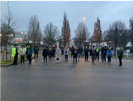
46 professionals join Somerset VRU for Day of Action in Bridgwater

District agency's raised concerns about young people effected by Anti Social Behaviour and substance misuse in Sedgemoor and a potential risk of exploitation from County Line drug dealing. The Violence Reduction Unit Data Group shared relevant information through a multi-agency triage of concerns, contextual safeguarding around at risk individuals and a professionals soft intelligence survey about the risk of County Lines. This information led to a support plan being put in place around the local PRU and support and disruption activity to reduce harm to those most at risk, including a Violence Reduction Unit led multi-agency day of action to target criminal exploitation.